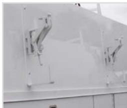
Side Mount Ladder Rack