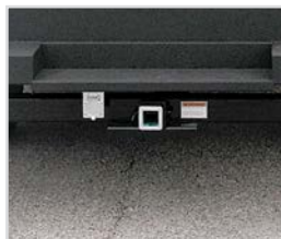
Class V Receiver Hitch