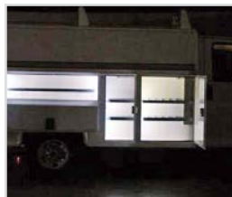
LED Compartment Lighting