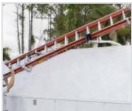
Power Ladder Rack