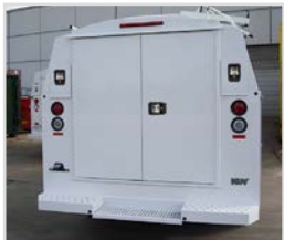
Solid Rear Doors