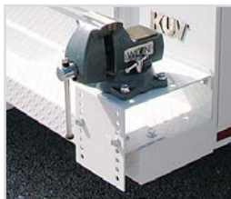
Mechanics Vise Bracket