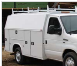
3 Bow Ladder Rack