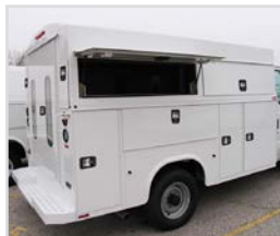
Side Access Door