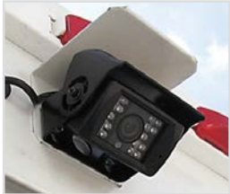
Rear Vision Camera