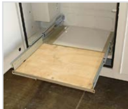
Pull Out Tray