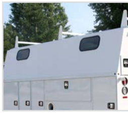
Upper Side Glass