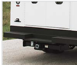
Knapliner Rear Bumper